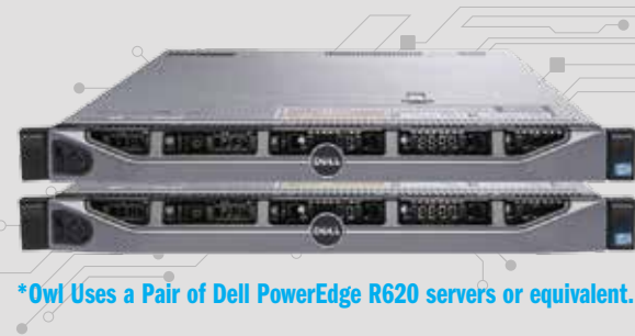
*Owl Uses a Pair of Dell PowerEdge R620 servers or equivalent.