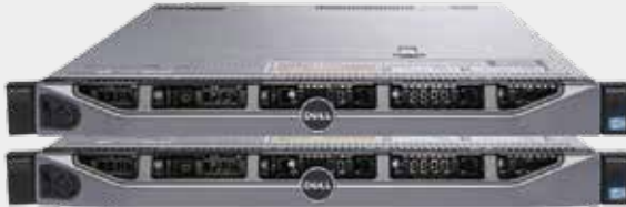
Owl Enterprise Cross Domain Solution (ECDS)