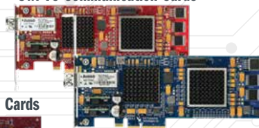
Owl V6 Communication Cards